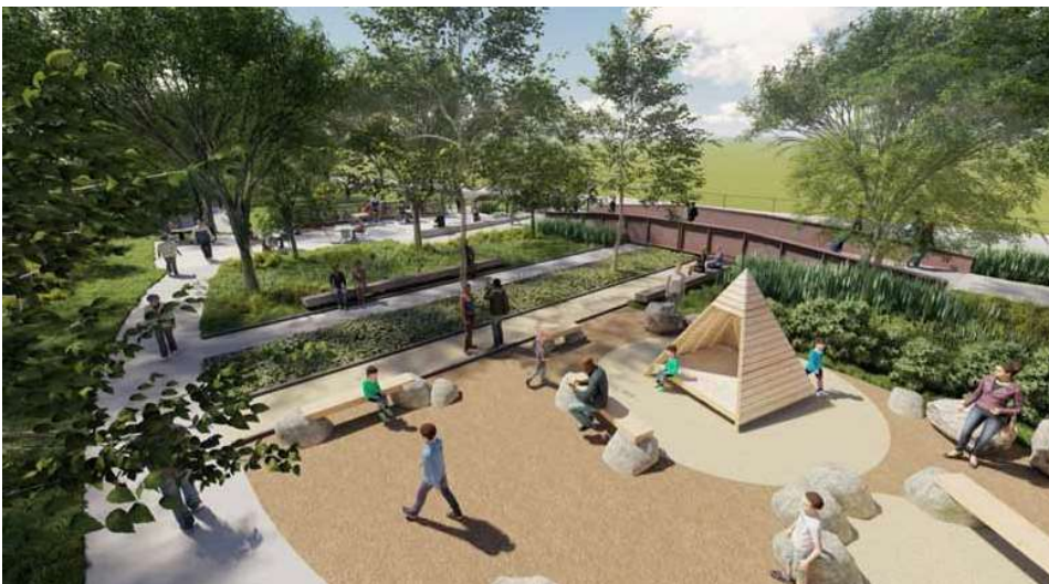
Lyttonsville Neighborhood Park will feature a handful of different seating options, gathering spaces, and play areas.

residents have long “pleaded” for a chance to improve their neighborhoods and the new park demonstrates an improvement the community sought after.