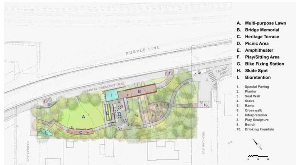
This park facility plan shows a number of different ways planners are hoping to utilize the 0.34-acre park that will be located along the Capital Crescent Trail and the Purple Line.

Residents from the Lyttonsville, Rosemary Hills, and North Woodside neighborhoods told Montgomery Parks planners that they wanted