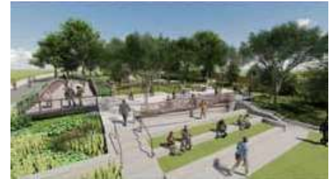
Planners estimate that Lyttonsville Park in S.S. may be delivered after 2028, pending completion of the Purple Line light rail line.

At the Sept. 7 Planning Board meeting, board members approved the project and will be proposed for final design and construction in the FY2025-2030 Capital Improvements Program. According to Montgomery Parks officials, construction of the park will likely begin in 2028, pending the completion of the Purple