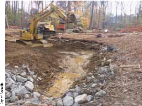
City of Rockville

Based on the information in this letter, we called for: (1) a common sense, temporary pause in “stream restoration” projects, (2) a temporary pause in the inclusion of “stream restoration” projects in new MS4 Permits and the County's design/build “Clean Water Montgomery Program” RFP, and (3) the initiation of a dialog among all stakeholders to discuss the relevant