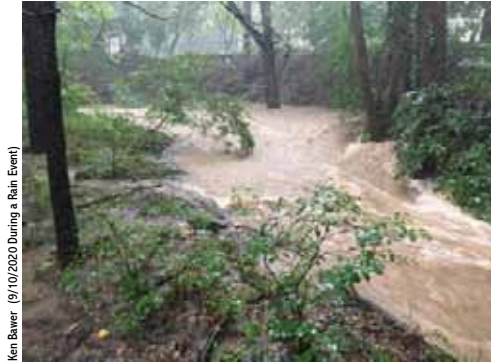
Ken Bawer (9/10/2020 During a Rain Event)

Even though "stream restorations" are demonstrably destructive to our relatively few remaining natural areas, the County and Parks are proceeding full speed ahead with these ecologically damaging projects. Consider the impact of "stream restorations" in Montgomery County: "To date, the County has completed