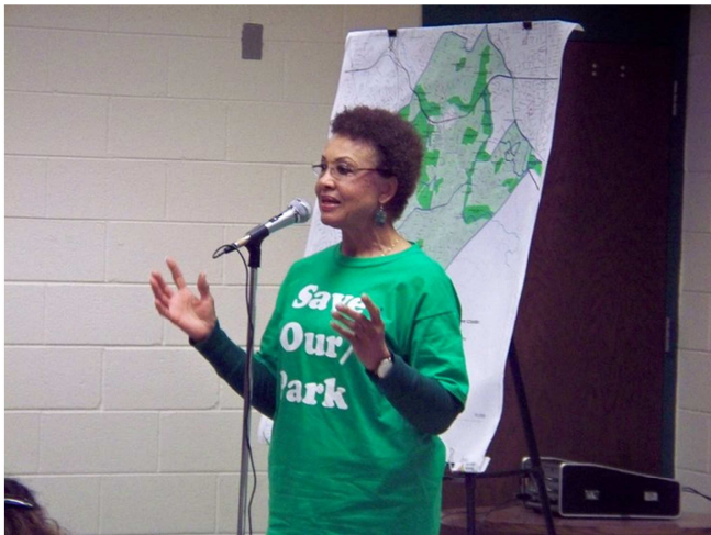
A member of the Save Our Park/Preserve Our Community Coalition testifies.