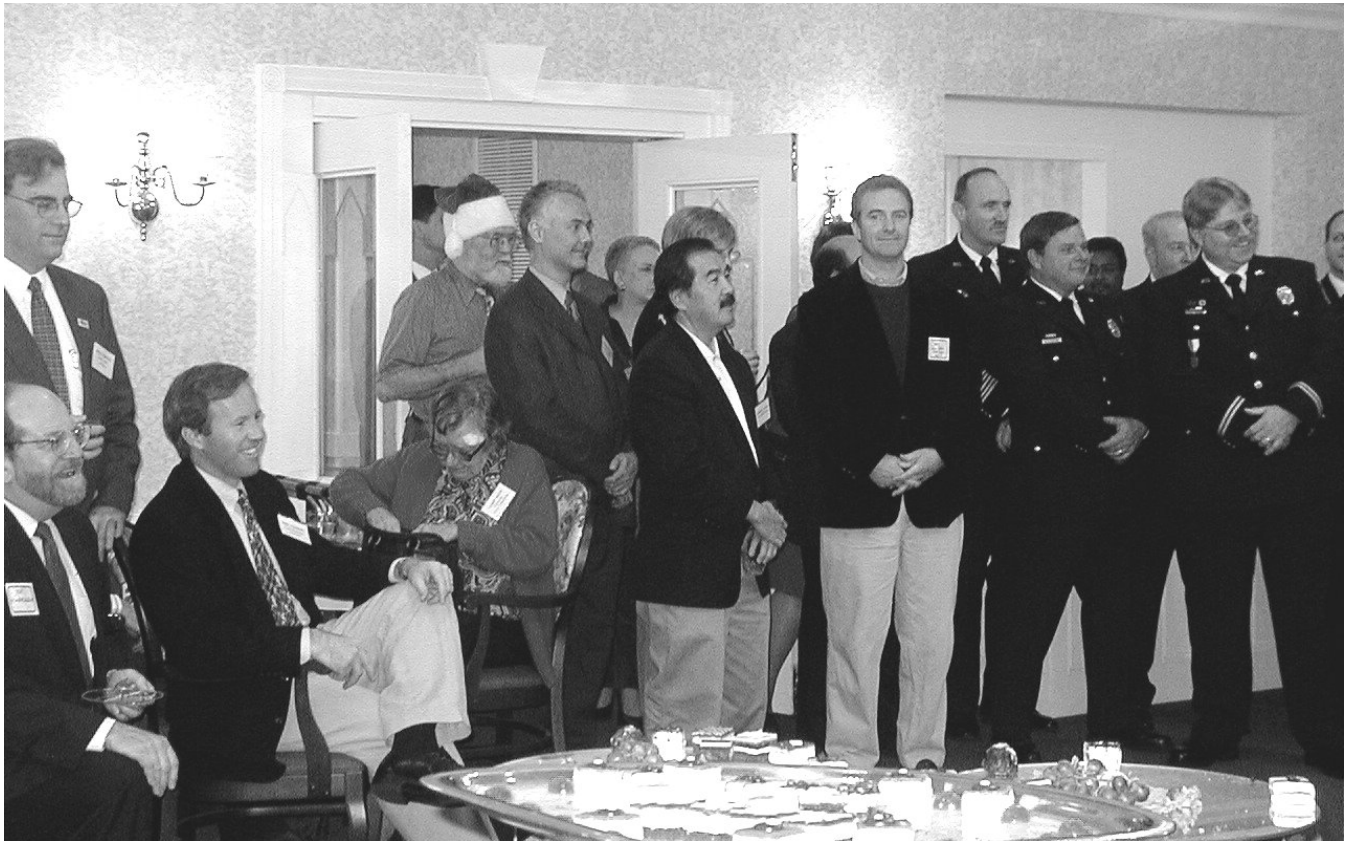
Scenes from last year's holiday reception.

bar for those who enjoy something with a little more kick.