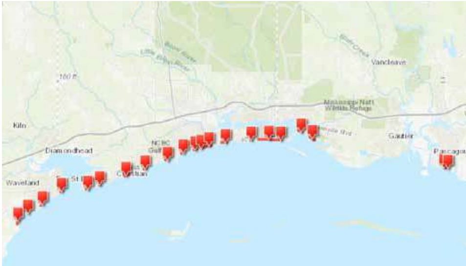
BEACH CLOSINGS ALONG THE MISSISSIPPI COAST IN 2019

ing rains in the upper Midwest and throughout the Mississippi River drainage caused billions of dollars of economic loss. The floodwaters had economic repercussions along the