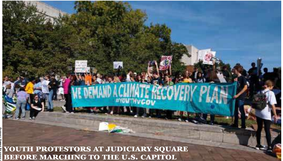
YOUTH PROTESTORS AT JUDICIARY SQUARE BEFORE MARCHING TO THE U.S. CAPITOL

both feet squarely in the cauldron of climate change and they intend to turn up the heat in the crucible of public policy debate to drive solutions. “May the Force be with Them!” ■