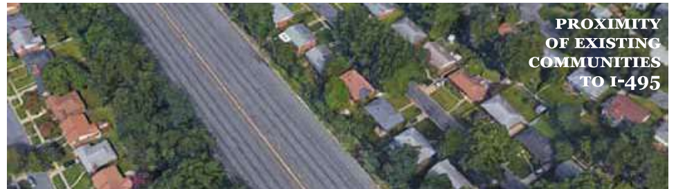
PROXIMITY OF EXISTING COMMUNITIES TO I-495

During extensive periods of congestion, travelers on the program corridor do not have an option to avoid delays; local and arterial routes are already saturated with traffic. Adding more general-purpose lanes is neither financially feasible nor is it likely to relieve congestion over the long term as the region's population is expected to grow and drivers—left without a reliable option that manages traffic demand—will be forced to drive in a congested corridor. While the Purple Line project and the State of Maryland's investment in Washington Metropolitan Area Transit Authority (WMATA) improvements