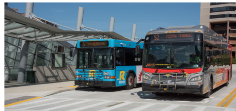
The new Silver Spring Transit Center

Montgomery County residents who are 18 years old and younger can travel around the county with ease by purchasing Ride On's Youth Monthly Pass, which provides unlimited rides on Ride On buses. The passes, which must be loaded onto the Youth Cruiser SmarTrip Card, can be purchased for $2 online or in